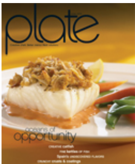
FISH & SEAFOOD