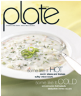
SOUP & SALAD